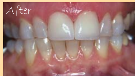
Zoom!® whitening and two Da Vinci porcelain veneers