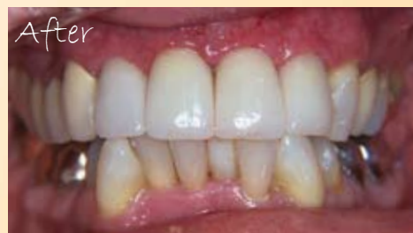
Zoom!® whitening and four Da Vinci porcelain veneers